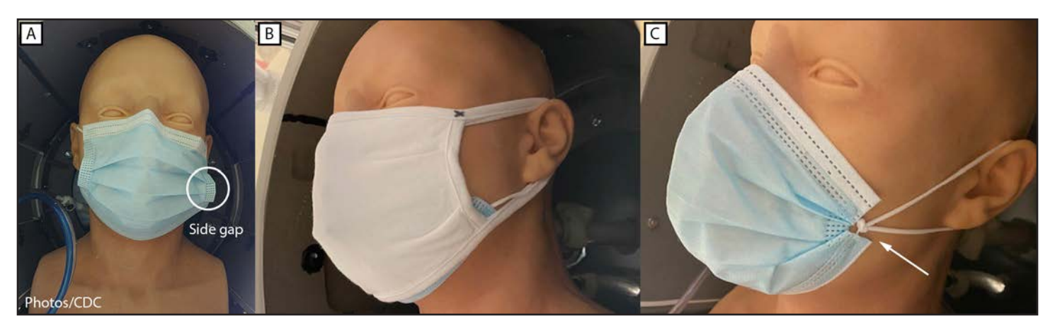
FIGURE 1. Masks tested, including A, unknotted medical procedure mask; B, double mask (cloth mask covering medical procedure mask); and C, knotted/tucked medical procedure mask

In the second experiment, adding a cloth mask over the source headform's medical procedure mask or knotting and tucking the medical procedure mask reduced the cumulative exposure of the unmasked receiver by 82.2% (SD = 0.16) and 62.9% (SD = 0.08), respectively (Figure 2). When the source was unmasked and the receiver was fitted with the double mask or the knotted and tucked medical procedure mask, the receiver's cumulative exposure was reduced by 83.0% (SD = 0.15) and 64.5% (SD = 0.03), respectively. When the source and receiver were both fitted with double masks or knotted and tucked masks, the cumulative exposure of the receiver was reduced 96.4% (SD = 0.02) and 95.9% (SD = 0.02), respectively.